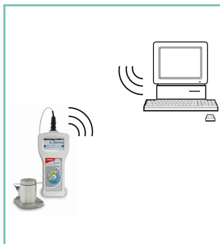
Option with wireless module