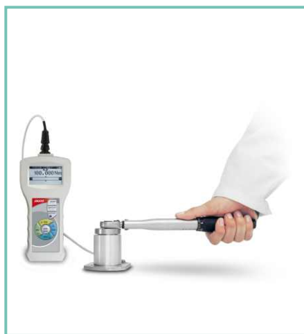
The way of checking torque wrenches