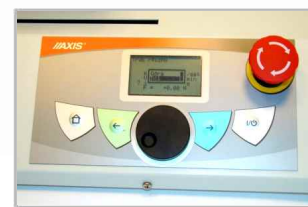
Motorized stand setting panel

STAV is designed for force meters mounted vertically. STAH - for force meters mounted horizontally.